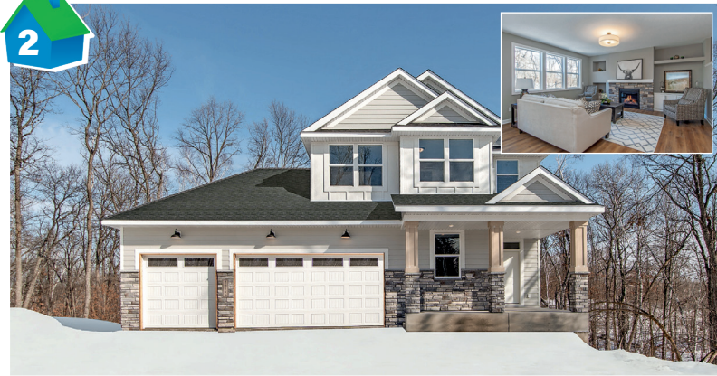
26116 PADRE PLACE • NISSWA, MN 56468

Beautiful Price Custom Homes 2-story home with plenty of room to grow by finishing the basement! This home includes 4 bedrooms, 3 bathrooms, a 3-car garage, and a sunroom! In the living room you will find a welcoming gas fireplace with built-ins and cubbies. Featuring custom cabinets, granite countertops throughout, stainless steel appliances, 4 bedrooms, and laundry on one level, two family rooms, and a private master bathroom with a walk in closet, this home is sure to impress!