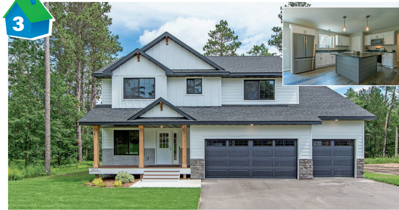
25313 TWINLEAF CIRCLE • NISSWA, MN 56468

Thomas Allen Homes stunning two-story in amazing downtown area of Nisswa. Walk or bike to Main Street. Kayak or paddle board on Clark Lake out lot. This home boast a beautiful kitchen, dining and great room combination. XL Owners suite and great sized rooms. 5 bd / 4 ba / 3 gar – 3,320 Finished Square Ft. We build home for downsizers to up-sizers in 4 area communities. Single level to multi level home plan are available. Stop in and see us to see much more.