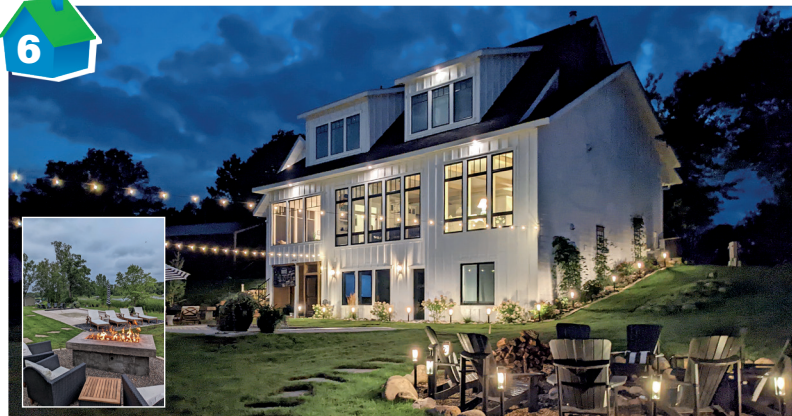
19522 LOVE LAKE ROAD • BRAINERD, MN 56401

This is a 2022 B-Dirt cottage style lake home that boasts over 4,000 square feet of bright inside appointments. The home has 4 bedrooms and 5 bathrooms. Take a dip in the heated pool or hot tub inside the screen porch. The large walk in showers and walk in closets are a must see. A large wood burning fireplace will keep you warm on the cold Minnesota nights. There is a large back up generator - "just in case". Relax in either of the screen porches or just sit by the outdoor fire. The tuck under garage will give you the added climate controlled space you need to store the lake toys.