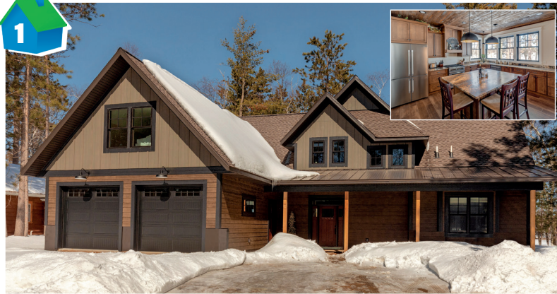
11850 HARBOR LANE • CROSSLAKE, MN 56442

Nestled in the North Woods where the views of the lake are as quaint as the loons calling. This custom home designed by North House Residential Design, is a distinctly created refuge to maximize separation of the primary bedroom and guest and office spaces making it an ideal design for families in all stages of life. As soon as you walk into the open main entry, the large windows throughout show off the focal attraction – the lake. The kitchen is made for entertainment, with extra space in the pantry, laundry & large garage right off the back entry. The upper walkway creates quiet for guests on either side of the home, whether for game time, sleep or home offices. Touring this home checks all the boxes on what true full-time lake-living should be!