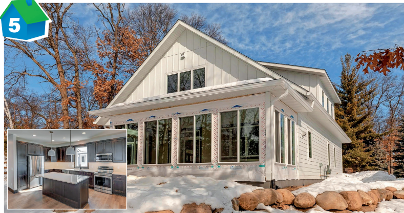
1741 GALWAY LANE • EAST GULL LAKE, MN 56401

This 4-bedroom 2.5 bath home within the Kavanaugh Resort has great lake views. There is also a large sunroom with a patio to enjoy those great summer evenings. It is optimally located at the end of Galway Lane, so it is ideal for privacy. Just steps away is the walking path that leads right down to the water's edge. Homeowners have full use of the resort's amenities. Many more lots are still available to build and customize your dream home.