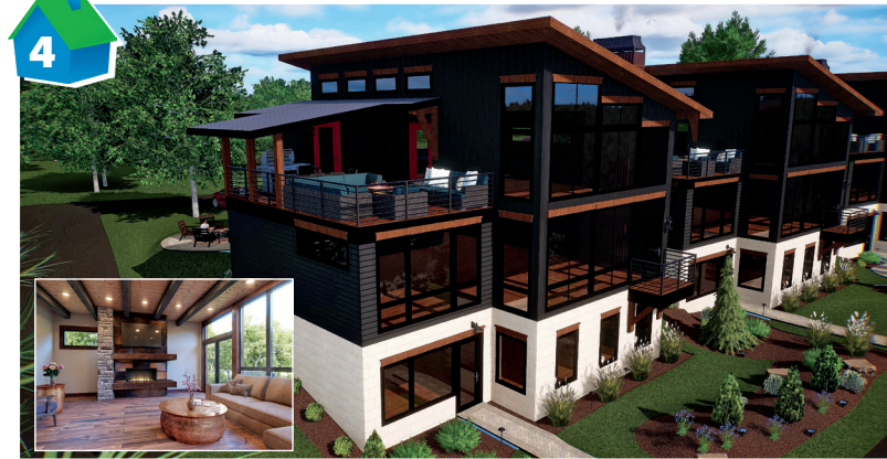
9830 BIRCH BAY DRIVE • NISSWA, MN 56468

Beautiful modern 5-bedroom, 7-bathroom home overlooking Gull Lake. Huge lake view windows on every level. Main level kitchen and great room featuring custom knotty alder cabinets and granite tops, reclaimed hardwood beams with wood ceilings and fireplace. Lower-level walkout with game room and wet bar. Upper-level owners suite with fireplace and wood accent wall. The exterior showcases a covered rooftop deck tailor made for entertaining. Includes access to Quarterdeck Resort amenities and rental income potential.