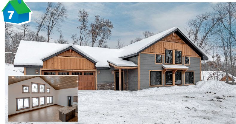
11310 KENNEDY ROAD • BRAINERD, MN 56401

This 2+ bedroom 2 bath home is located in a beautiful heavily treed development just minutes from Brainerd. It is located on a 2.5 acre lot and has an open floor plan, very spacious, beautiful wall of windows in the main living area, abundant natural light, custom kitchen cabinetry, center island, stainless steel kitchen appliances, granite counter tops, LP Smartside, generous sized bedrooms and a beautiful owners' suite, plus a heated garage.